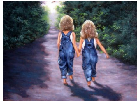
“My Best Friend”

“The artist is an educator of artists of the future...(Saul Steinberg)