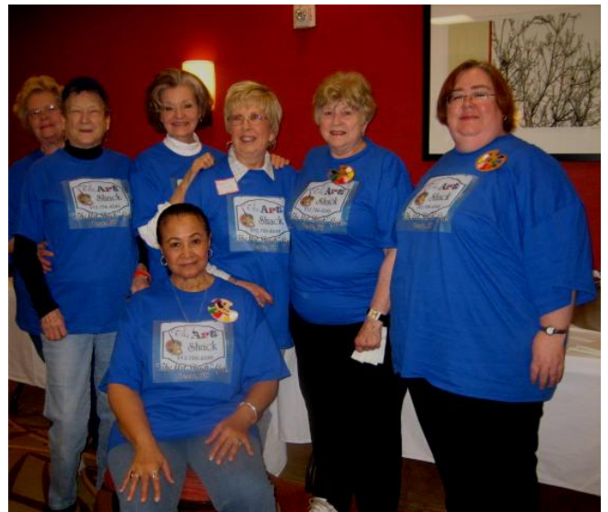
The group from The Art Shack in DeSoto, Kansas--- and proud of it!