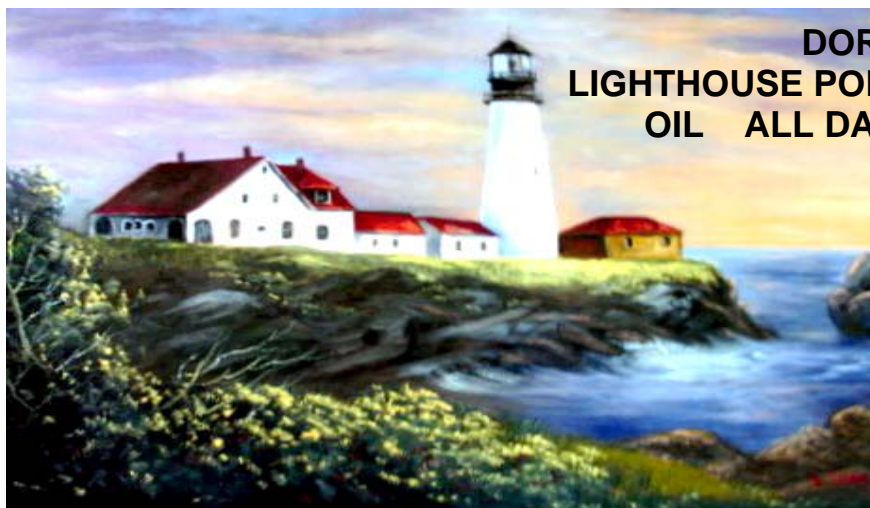
DOROTHY DENT—' LIGHTHOUSE PORTLAND HEAD' OIL ALL DAY in the studio