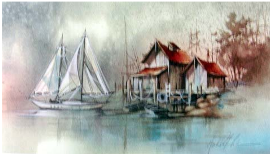
MARK POLOMCHAK—'MORNING SAIL' WC ALL DAY In the barn

EVERYDAY~ MORNING Sessions 9:30 TO 12:30 LUNCH 12:30 TO 1:30 AFTERNOON Sessions 1:30 TO 4:30