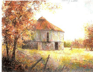
16" x 20"