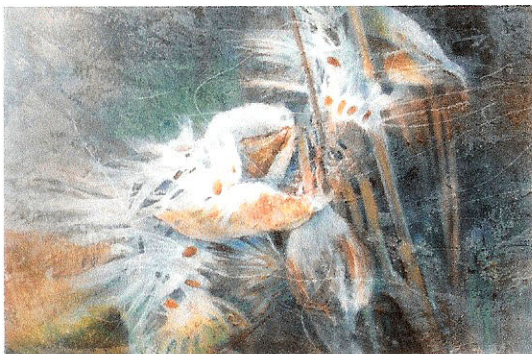
Friday Acrylic Texture "October Pods"