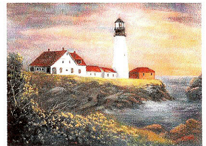
16" x 20"

You have to base coat your canvas with acrylic peaches and cream, have ready for the class.